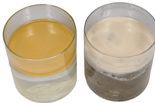
Test samples: Container on left shows untreated oil and water. Container on right was treated with Ultra-Archaea and shows that only lipids were left after the bio-remediation took place. The dark material in the bottom of the container is the clay carrier.

Ultra-Archaea products should be stored and applied between 32°F and 120°F (Ideal temp is 40°F - 110°F). Temperatures outside that range may cause the microbes to become ineffective. Ultra-Archaea should not be exposed to radiation. Ultra-Archaea should only be used in applications where the pH is between 5.0 and 8.5. Visit our website, www.Ultra-Archaea.com to view our FAQs and test data.