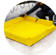
Mini Foam Wall