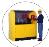
Ultra-Hard Top Plus