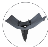
Ultra-Drain Guard, Heavy Metal Model