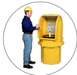
Ultra-Hard Top P1 Plus