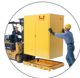
Ultra-Safety Cabinet Bladder System