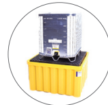
Ultra-IBC Spill Pallet